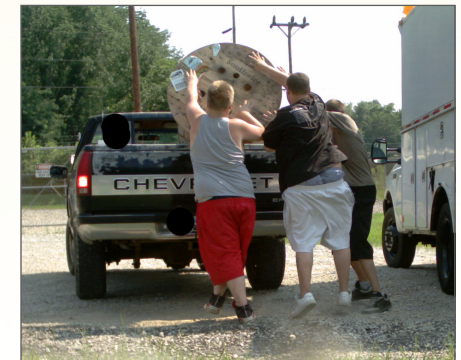
CRI hidden cameras capture three copper thieves.

CRI is a non-profit organization established to provide technical support to law enforcement agencies. Since its formation, CRI - which is aided by retired law enforcement volunteers - has provided technical equipment and support to federal, state and local law enforcement agencies. Many times these agencies do not have the funding nor the expertise to buy and maintain the equipment needed to effectively conduct investigations. CRI researches, purchases and maintains cameras, recording mechanisms, tracking devices and other technical products and provides these high-tech tools free of charge to police departments.